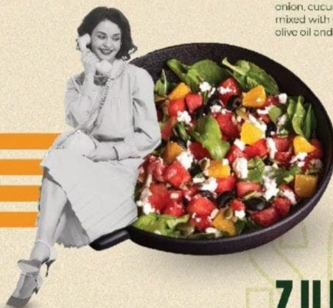
Insalata di Feta e Anguria