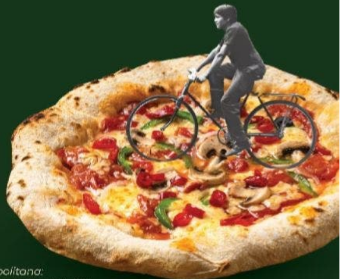
Napolitana: Verdure Peperoncino

Feta cheese, mozzarella, caramelized onions, broccoli, red paprika, black olives and onions