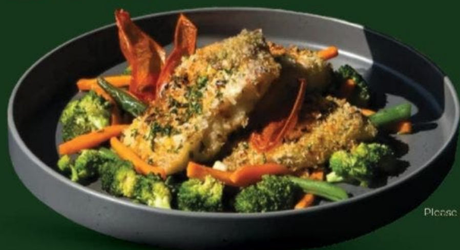
Pesce Al Forno Con Verdure

Pan-seared basa fillet in garlic butter, served with stir fried vegetables and creamy lemon parsley sauce