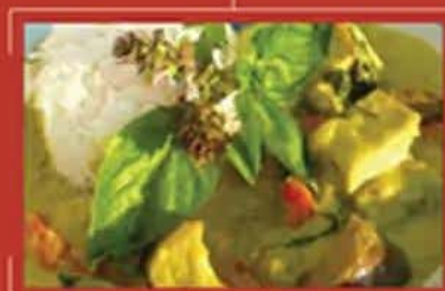
Thai Green Curry