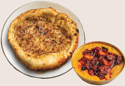
SOUR DOUGH NAAN with PANEER GHEE ROAST