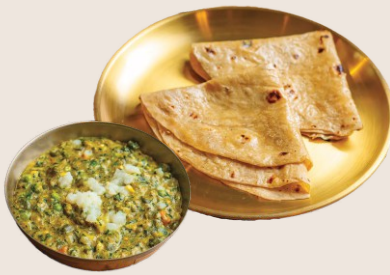
SUBZI BAHAR with BUTTER CHAPATI