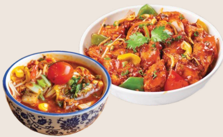
THUKPA SOUP with PANEER CAMLIN