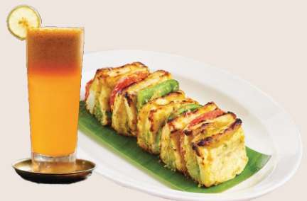
PEACH MINT with PANEER HILLTOP