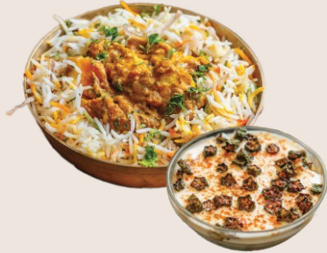
PANEER BIRYANI with BHINDI RAITA