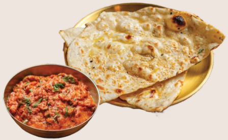
VEG PANCHRATNA with BUTTER NAAN