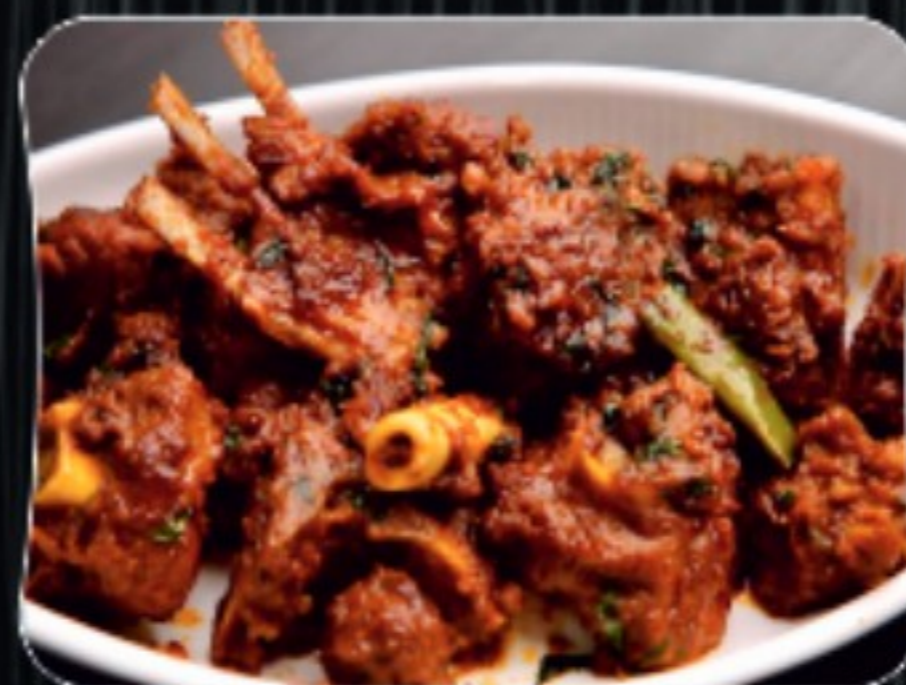
Mutton Bhuna Rs. 100/- 1 Piece