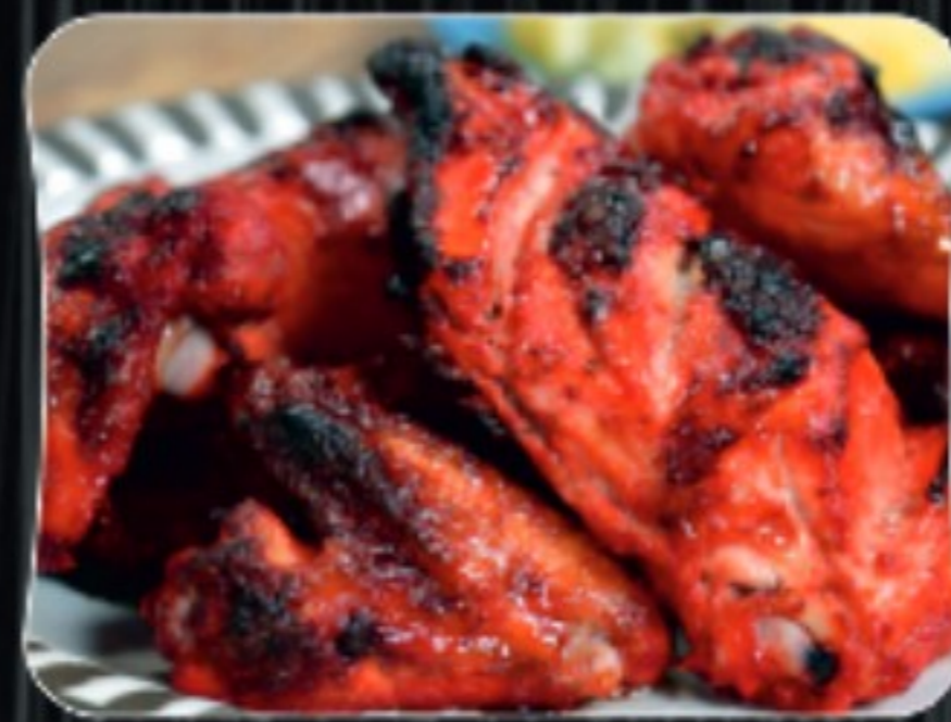
Chicken Tandoori Rs. 99/- 2 Piece