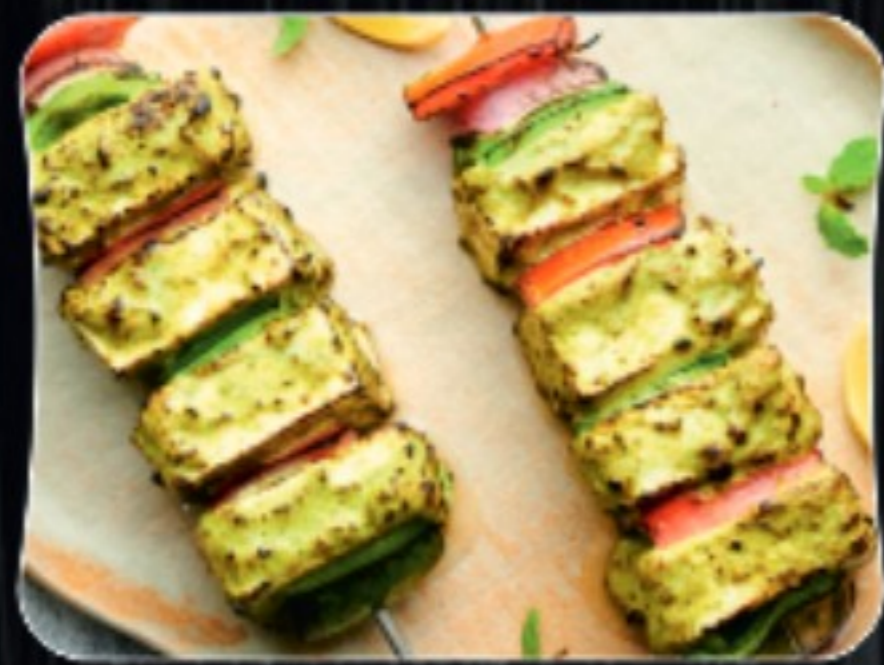
Paneer Pahadi Kebab Rs. 99/- 2 Piece