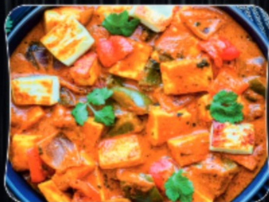
Paneer Tika Masala Rs. 75/- 1 Piece