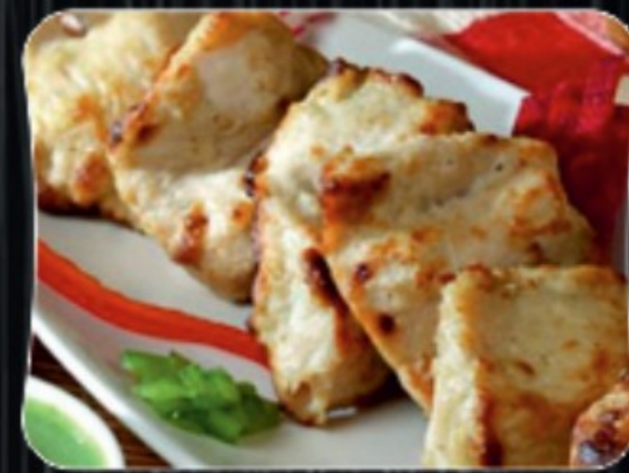
Fish Malai Kebab Rs. 99/- 2 Piece