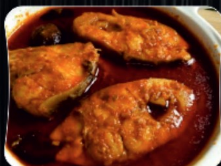
Katla Masala Rs. 100/- 1 Piece