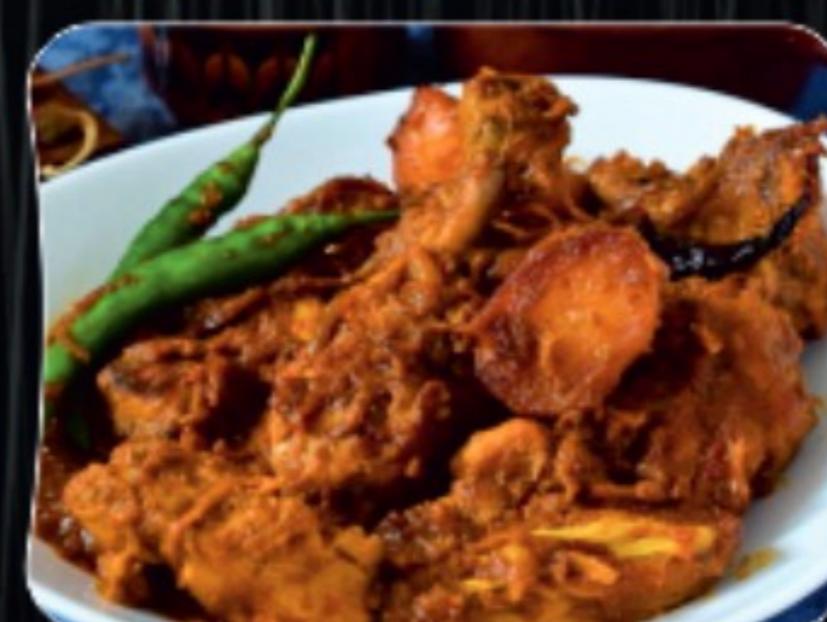
Chicken Kosha Rs. 75/- 1 Piece