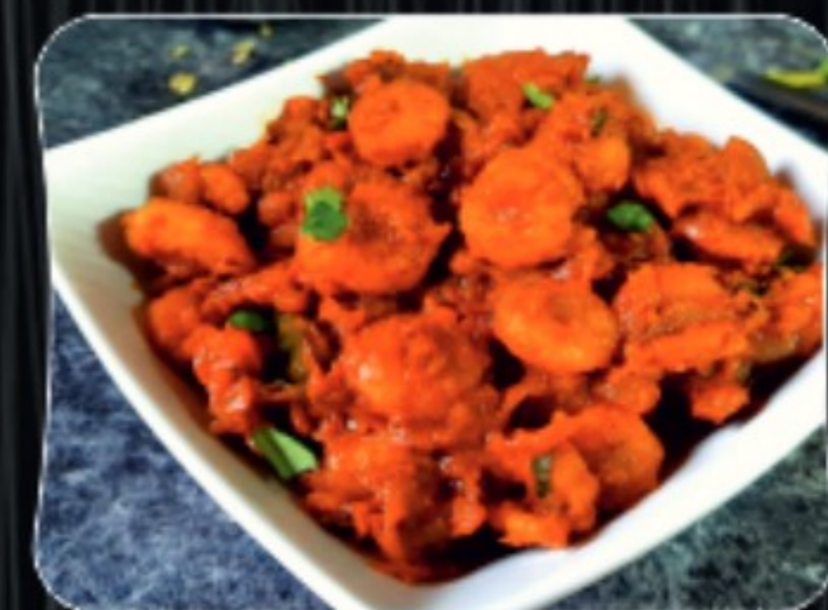
Prawn Masala Rs. 100/- 2 Piece