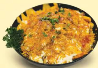
Loaded Chicken Fries