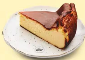
Turkish Cheese Cake