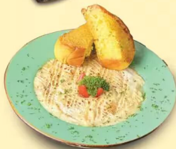
Patate Al Forno