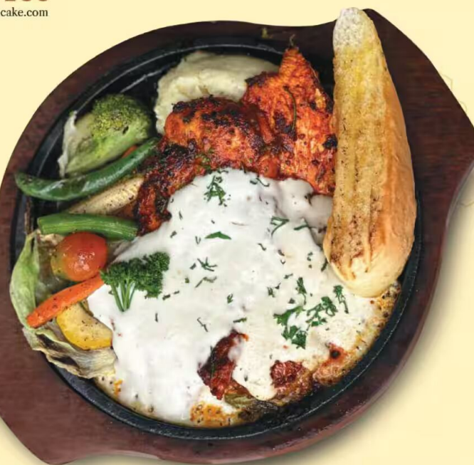
CHICKEN SIZZLER STEAK ₹ 440/-