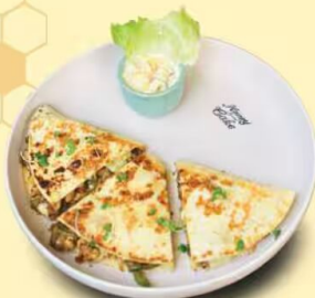
Chicken Quesadilla ₹ 240/-