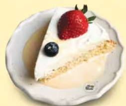
Classic London Milk Cake