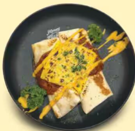
Enchiladas Beef ₹ 320/-