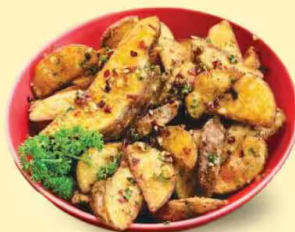
Chilly Potato Wedges