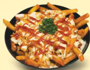
Creamy Chicken French Fries