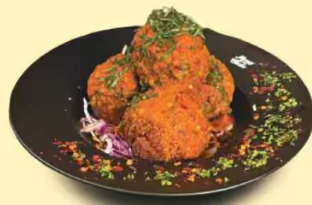
Serbian Meat Balls ₹ 340/-