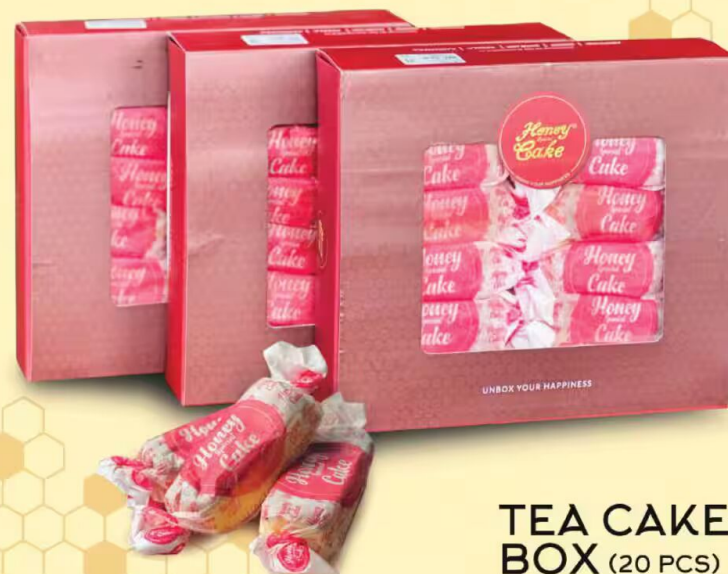
TEA CAKE BOX (20 PCS)

UNBOX YOUR HAPPINESS www.honeyspecialcake.com