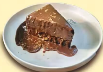
Rich Matilda Chocolate Cake

Desserts are the whispers of a sweet farewell. Like the golden light at the end of a beautiful day, each bite holds a promise of delight and a hint of nostalgia. Sweetness and warmth linger, like a perfect memory meant to be savored.