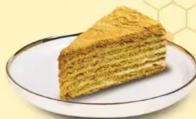
Russian Honey Cake Classic