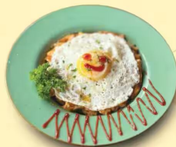
Cheese Chicken Potato Chopsuey