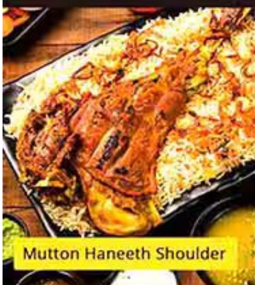
Mutton Haneeth Shoulder