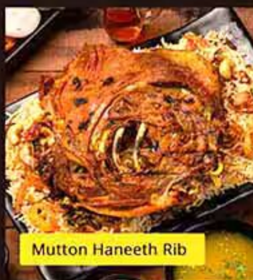
Mutton Haneeth Rib